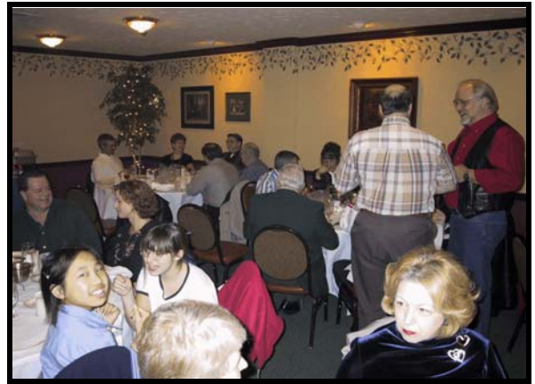
Christmas Party 12/15/2001