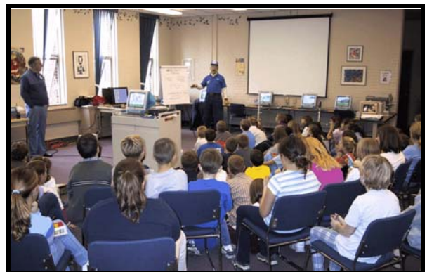
Independence Middle School 12/19/2001